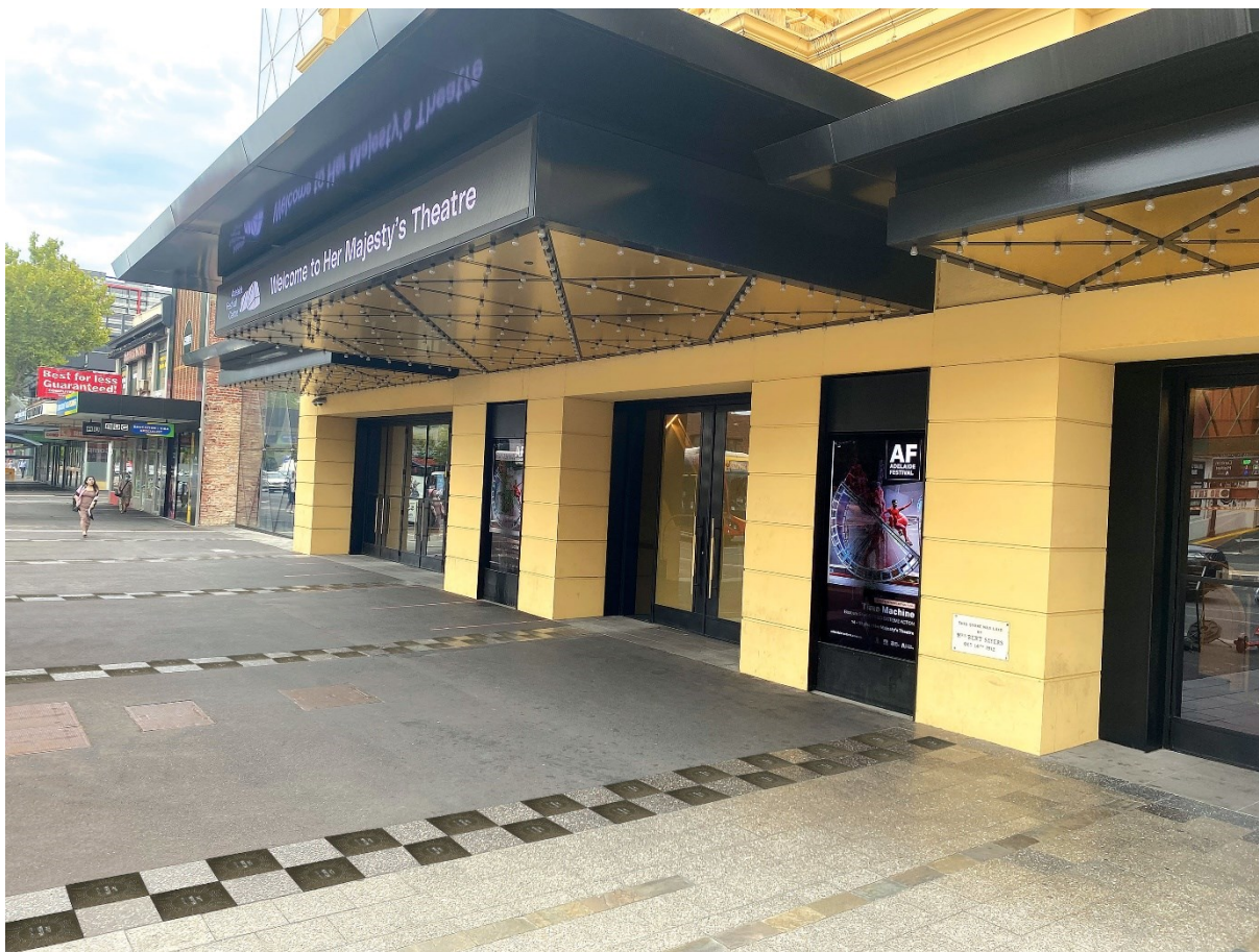
HMT stars mock-up.